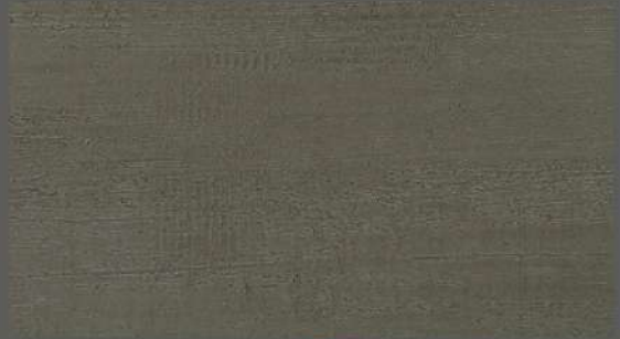
TV 3033 Gray Sand NEW