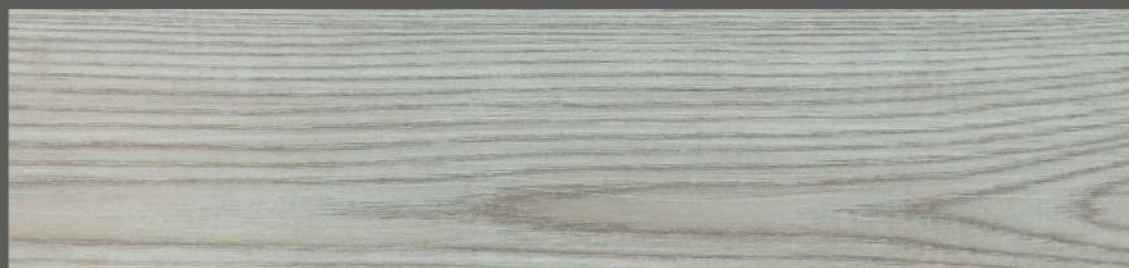
TV 3031 Charleston Teak NEW

Size 152.4mm x 914.4mm 24 pieces/box 3.34sqm