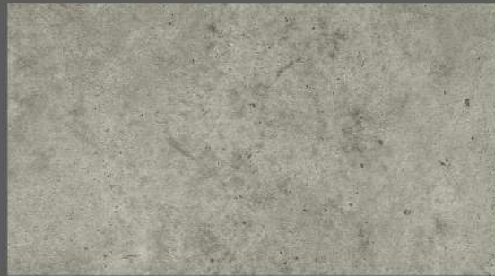
TV 3024 Grey Slate