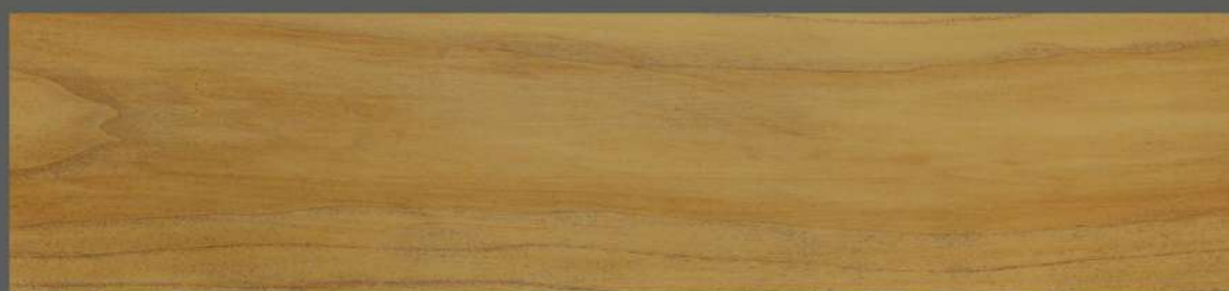
TV 3030 Butternut Teak NEW