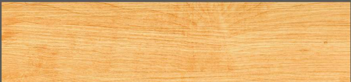
TV 3010 Warm Cherry