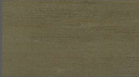
TV 3032 Natural Sand NEW

Size 304.8mm x 609.6mm 18 pieces/box 3.34sqm