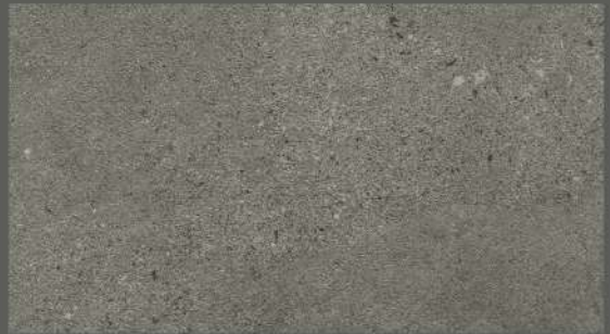
TV 3026 Stone