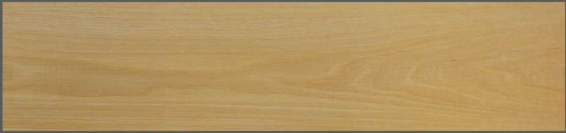
TV 3029 Summer Teak NEW

Size 152.4mm x 914.4mm 24 pieces/box 3.34sqm