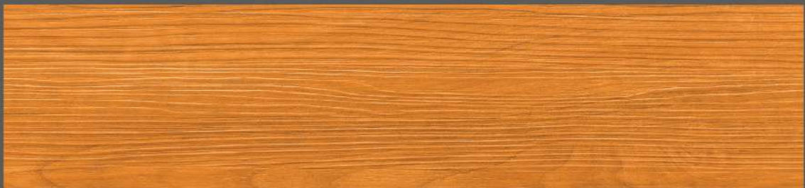
TV 3006 Real Cherry