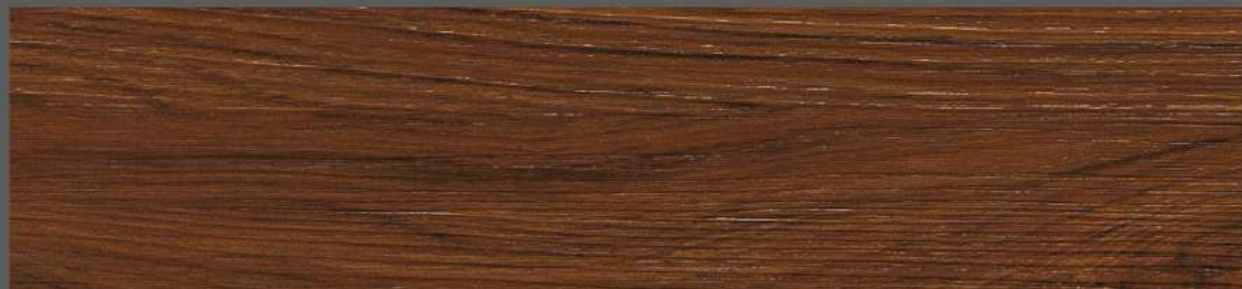
TV 3007 Merbau Wood