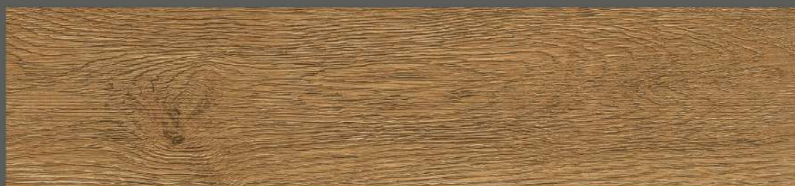
TV 3005 Vintage Oak