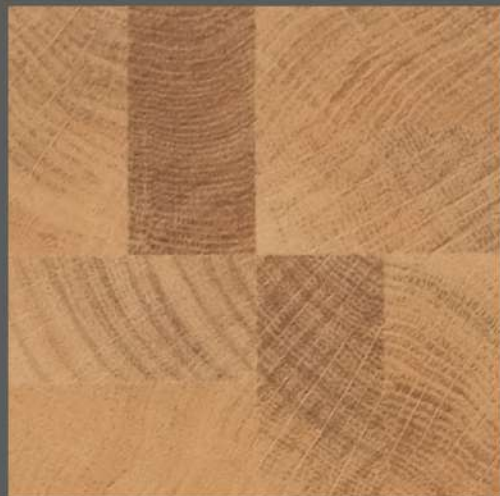
TV 3027 Mozaic - Natural

Size 457.2mm x 457.2mm 16 pieces/box 3.34sqm