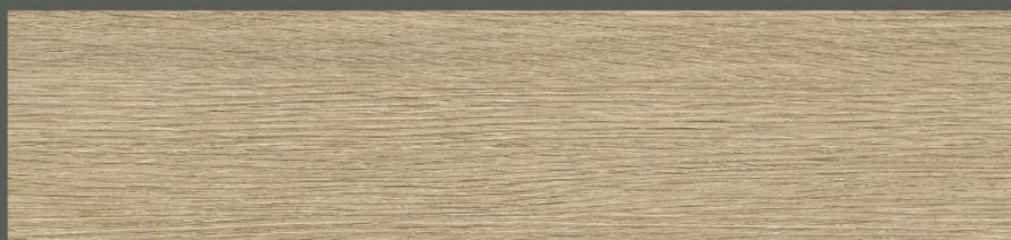
TV 3003 Washed Oak