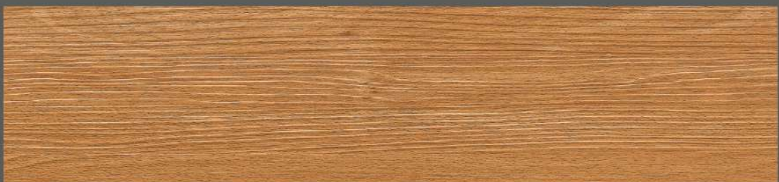
TV 3014 Natural Beech