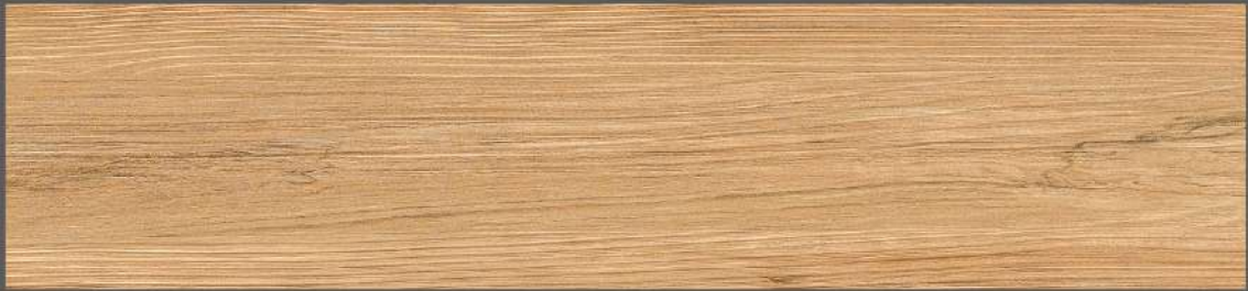
TV 3008 Sand Malmo