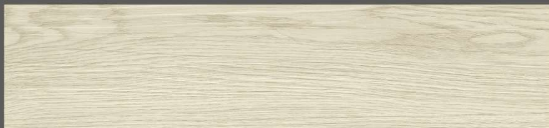
TV 3013 White Oak