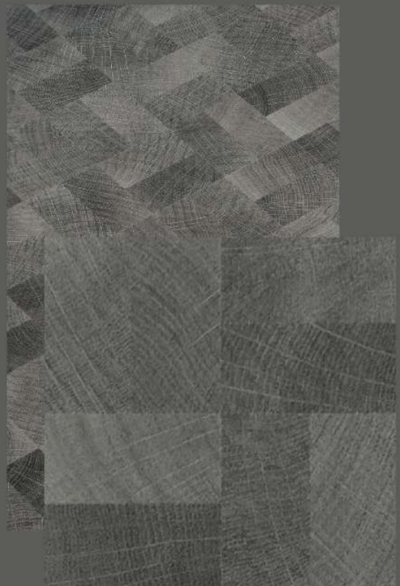
TV 3028 Mozaic - Grey