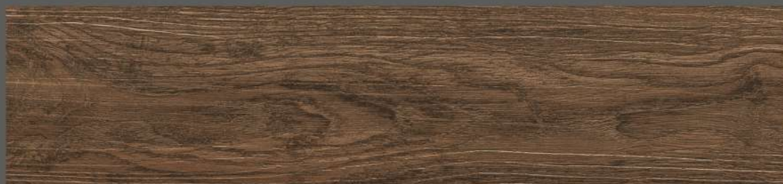
TV 3001 Rustic Oak