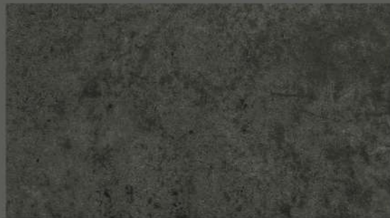
TV 3025 Dark Grey Slate