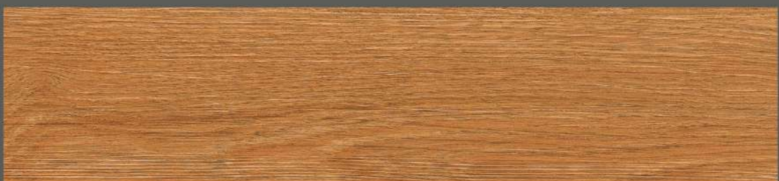
TV 3004 Parma Oak