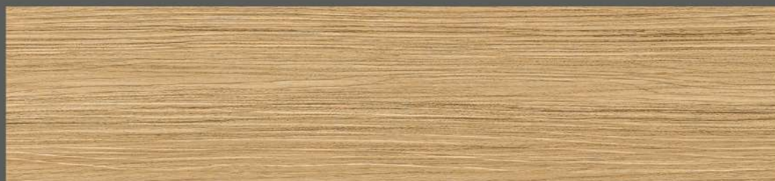
TV 3015 Vicenza Elm