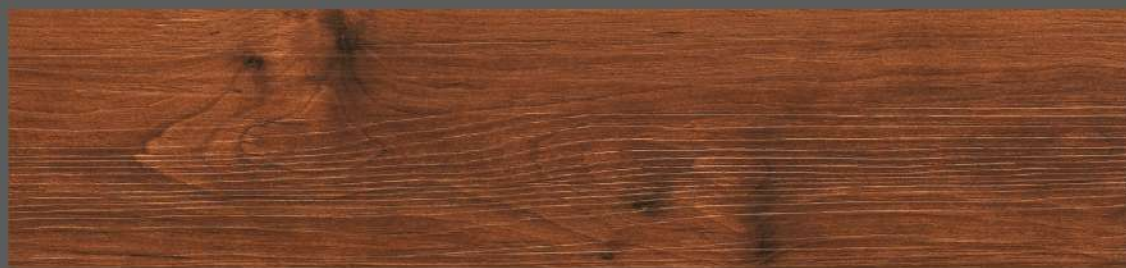
TV 3017 Original Cherry

Size 152.4mm x 914.4mm 24 pieces/box 3.34sqm